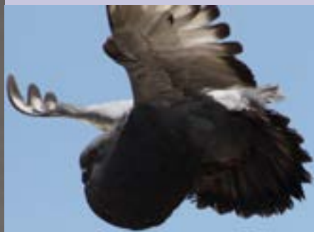
Marcenero Pouter in flight